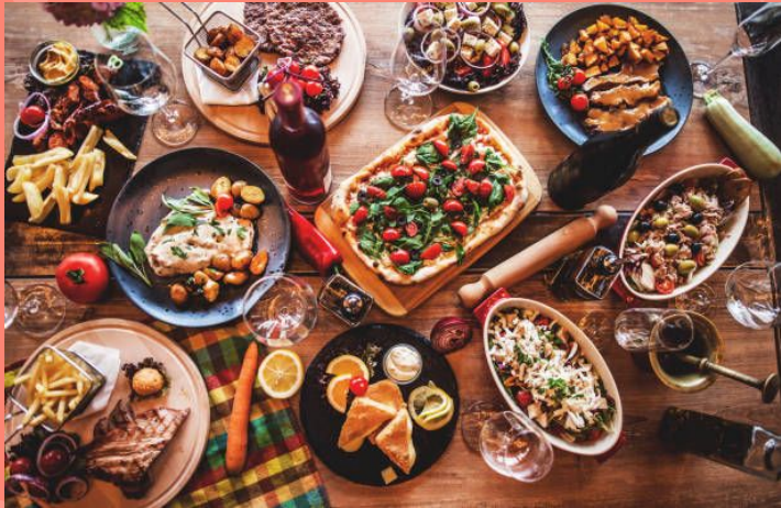
(wine not included)